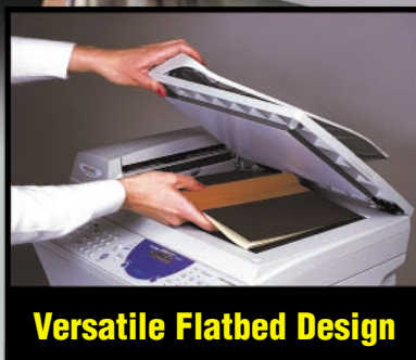
Versatile Flatbed Design